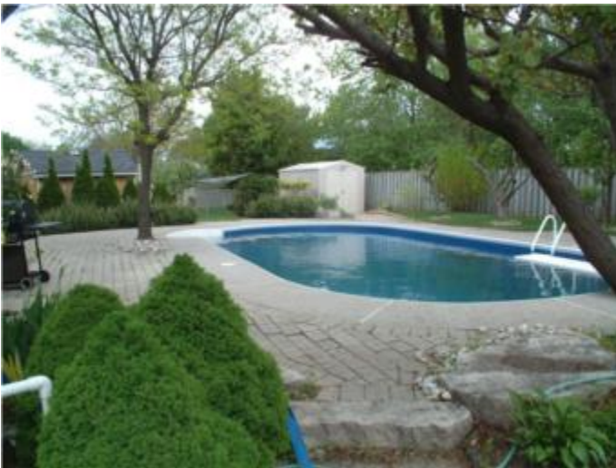
Professionally landscaped yard with pool