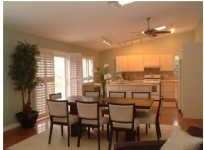
Kitchen with patio walk-out