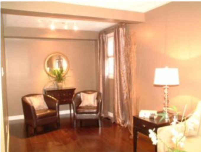
Living Room Sitting Area