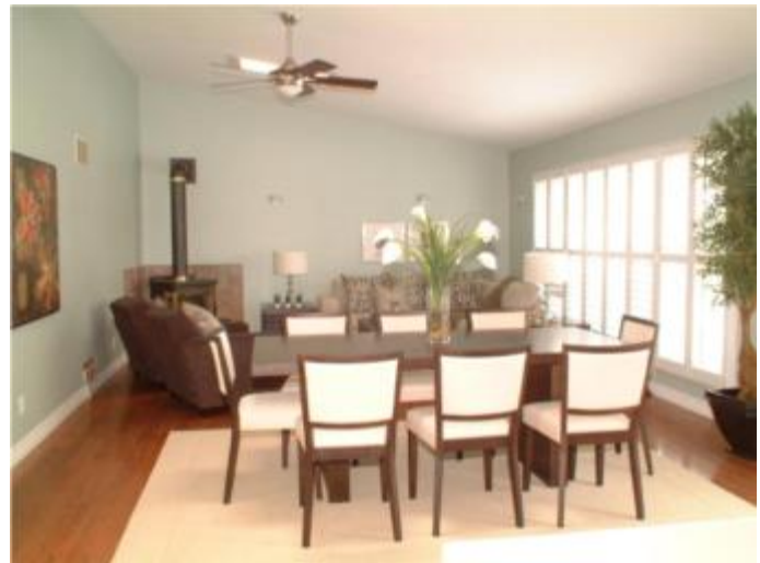
Great Room w/gas burning wood stove